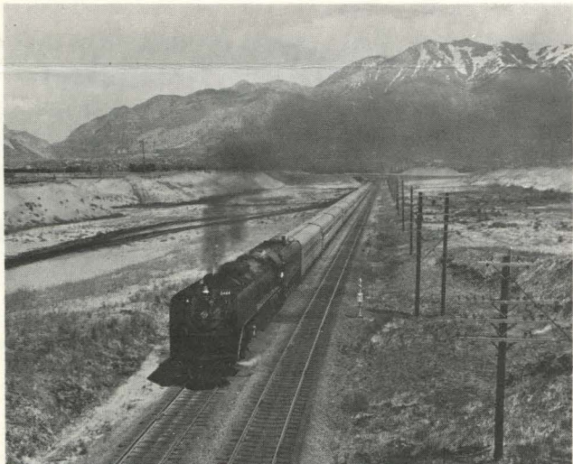
Old No. 8444 played one of the starring roles in Utah. Pictured here leaving Ogden, the old locomotive made four round trips between Ogden and Salt Lake City, pulling twenty coaches. In four days, almost 3,250 passengers made the round trip.