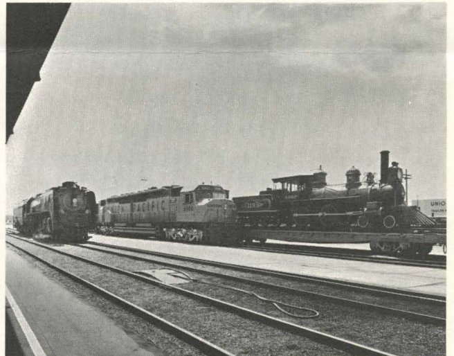
Another historic meeting of locomotives was staged in Utah during 1969—this time in Ogden. This photo was taken when denizens from the past posed with a behemoth of the future.