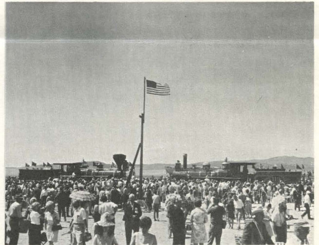
This was the scene shortly after the ceremonies at Promontory. The photo is very similar to one taken a century ago by Russell and featured in the May INFO. Nearly 12,000 people were on hand at Promontory for the occasion.