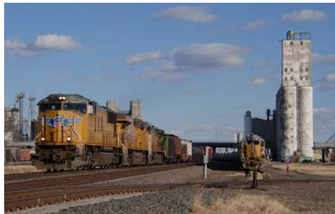
Westbound at Fremont, Nebraska.