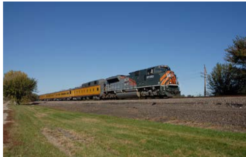
192nd Street, Omaha.