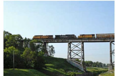
Lane Cutoff, Omaha.